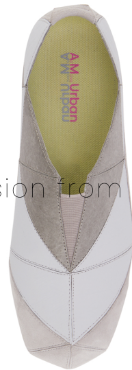
the vision from illusion