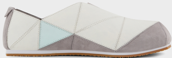
classic white/ 经典白