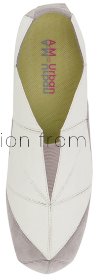
the vision from illusion