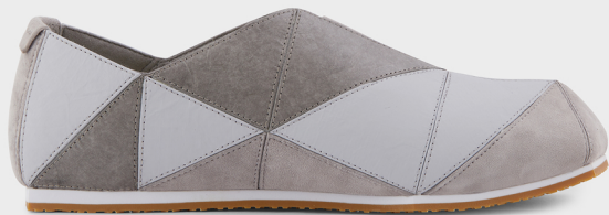
silhouette grey/ 剪影灰